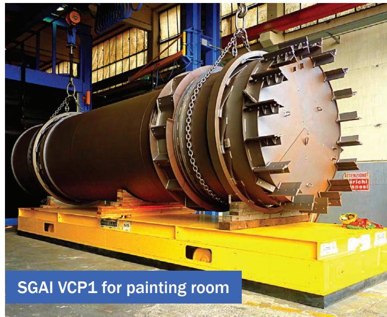
SGAI VCP1 for painting room