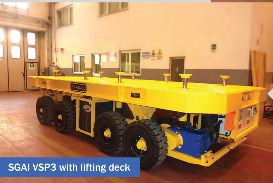
SGAI VSP3 with lifting deck