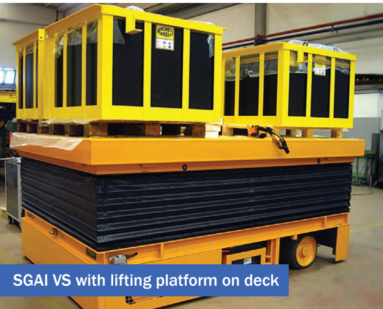
SGAI VS with lifting platform on deck