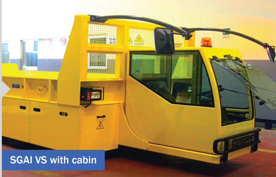
SGAI VS with cabin