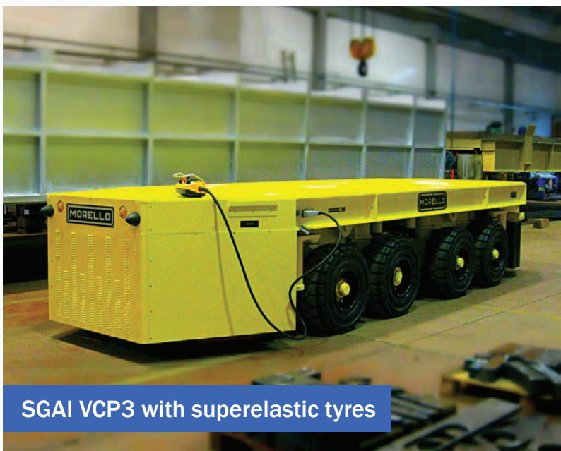
SGAI VCP3 with superelastic tyres