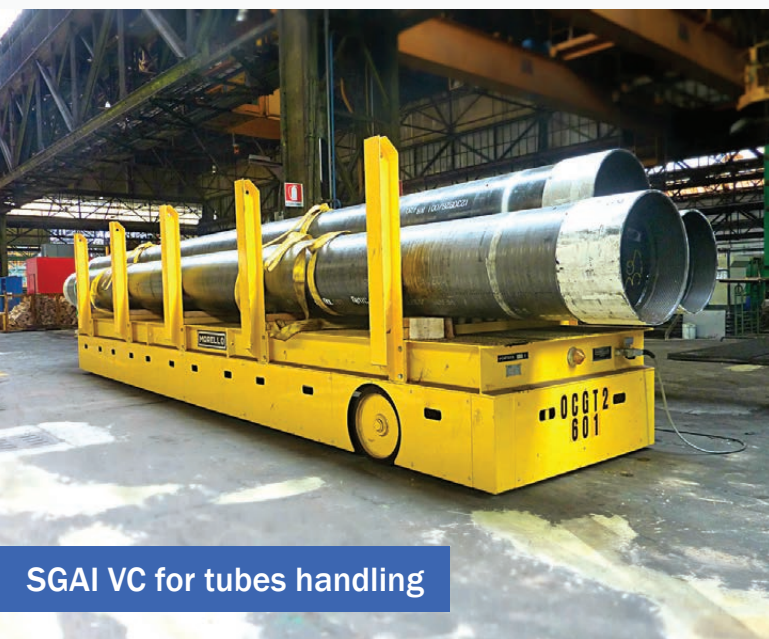
SGAI VC for tubes handling