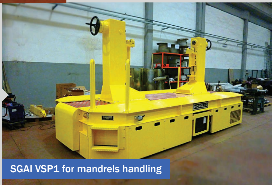
SGAI VSP1 for mandrels handling